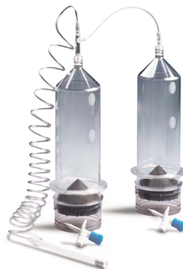
Dual syringe kit plus 60" low pressure T-tubing with prime tube and two fill spikes