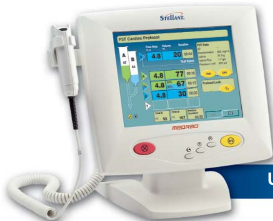
Classic Medrad® Stellant® Display Control Unit (DCU)

Available with either the Classic monitor or with the Certegra® Workstation