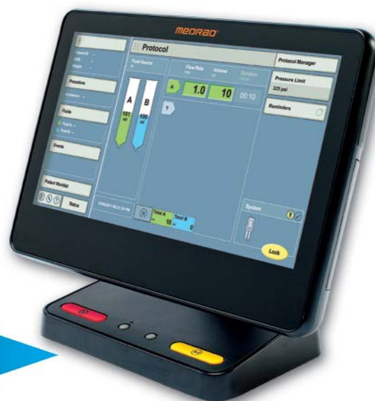
Certegra® Workstation for Medrad® Stellant® D Injection System The command center for intelligent CT Contrast Dose Management™ Solutions.

The Medrad® Stellant® D efficiently increases throughput with: